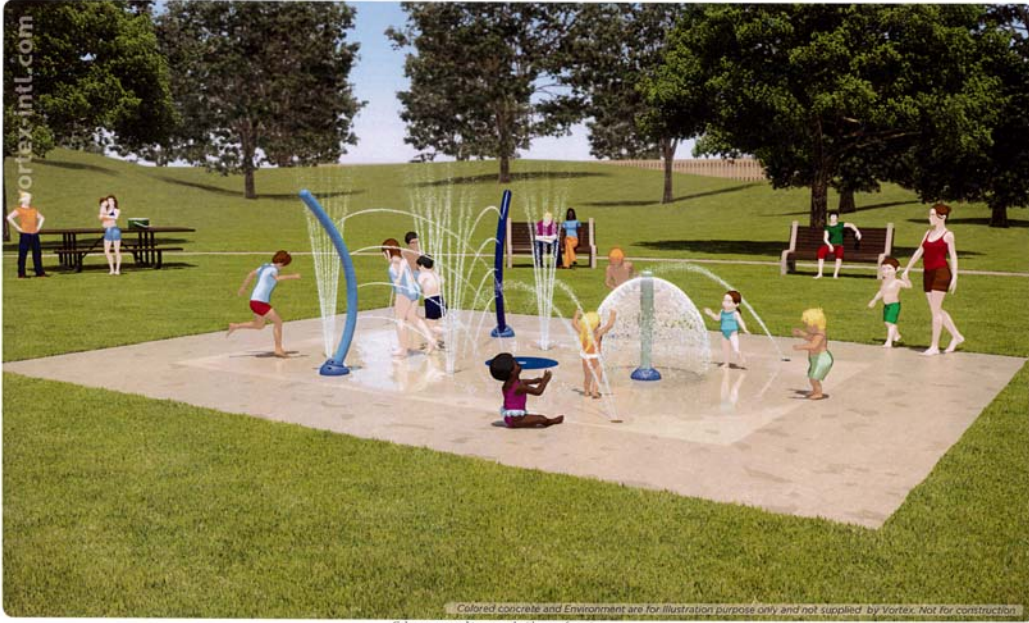
Mayerthorpe Splashpad Addition, Alberta

Colours approved to proceed with manufacturing